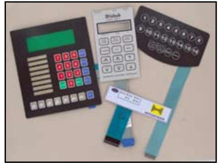
Pressurebond® Membrane Switches

Pad printing Plastic overlays and decals Plastic parts and fabrications Plastic tables and charts Plastic windows and scales Printed cylindrical parts Pressurebond® Membrane switches Product components Product marking Read out windows Second surface printing Self adhesive products Serial number tags Serialized nameplates and numbers Specification and warning plates