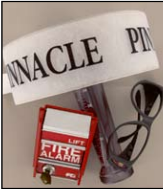
Marking Difficult Parts

Access cards and credit cards Adhesive application Aluminum nameplates Back lit panels Chassis marking & finishing Conductive ink printing Control panel overlays