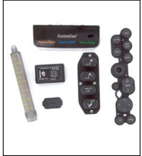
Value Added Products

Access and swipe cards Acrylic brackets Acrylic panels Aluminum nameplates Back lit panels Branding and tracking Calibration gauges Control panels Decals Dials Edge lit panels Electrodes Electronic marking solutions Faceplates Ø GERM-GATE™ Anti-microbial coating Instructional application labels In-vitro & in-vivo class VI marking Labels and nameplates