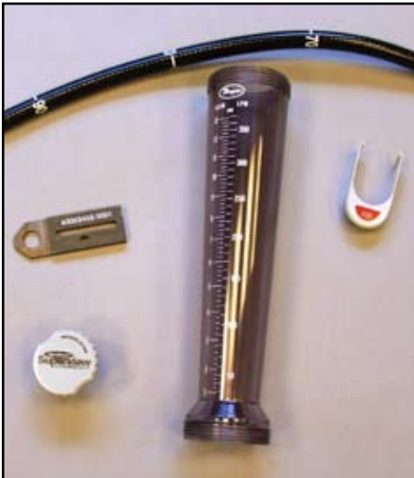
Medical Parts Marking

Markers Marking and branding parts Operating instruction plaques Packing and assembly Permanent asset serial number and instructional possibilities Plastic shields and chassis PressureBond® Membrane switches Printed cylindrical parts Printing on custom plastic medical parts for branding Probes and accessory holders Product markings Research and development Scales and templates Tool holders